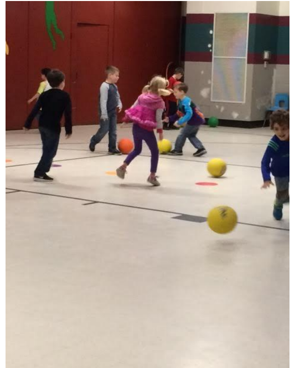
PE Students Having Fun!

The PTO and C.P. Smith Staff are helping to make the holiday season a little brighter for families and friends in our school community through a Donation and Gift Collection. Please consider making a donation to the C.P. Smith PTO for purchasing some essentials and gifts to give to those of us who could use a hand. Or donate a new book or a board or a card game. Please give all donations to the C.P. Smith Main Office by December 18.